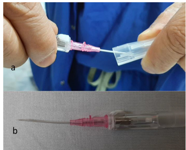
Figure 2 The IV needle-cannula shield (a) can be used to bend the set by a few degrees (b) while maintaining sterility.

Instead of parallel advancement, we suggest a slight upward tilt (Fig. 1c) to create an arrowhead-shaped tip that has the least chance of puncturing the upper/lower vein