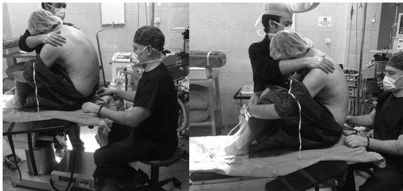
Figure 3 Squatting position. The picture shows the positions of the patient, the nurse anesthetist, and the anesthesiologist.

mass index (BMI) were recorded. Patients were randomly assigned to one of three parallel groups in 1:1:1 ratio to receive CSEA in three different sitting positions: the traditional sitting group (Group TSP, n=120), the hamstring stretch group (Group HSP, n=120), and the squatting group (Group SP, n=120). Patients in group TSP were placed in a sitting position with their legs on a stool at the edge of the operation table, their knees flexed to 90°, and their hips adducted (Fig. 1). Patients in group HSP were seated with their lower extremities placed on the operation table, knees