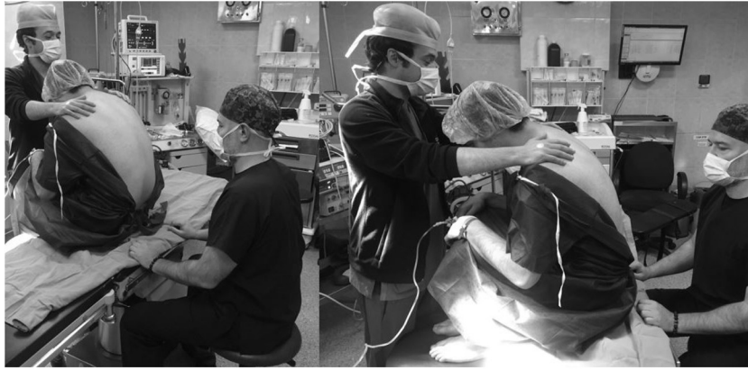
Figure 1 Traditional sitting position. The picture shows the positions of the patient, the nurse anesthetist, and the anesthesiologist.