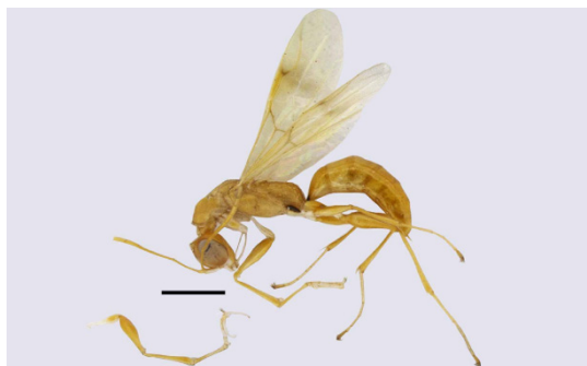
Figure 1. Dryinus auratus sp. nov. Female. 1. Habitus, scale bar = 1mm.

Description. Holotype female (Figure 1). Fully winged; length 5.2 mm. Body predominantly golden yellow, except by a spot in outer side of mesocoxa, dorsal petiole and basal portion of the first abdominal tergite black. Antenna clavate; length of antennal segments in following proportions: 8:6:24:14:11:9:8:8:7:8.5. Head dull, granulated; frontal line absent (Figure 2); occipital carina incomplete, laterally not reaching eyes, not present on temple (Figure 3); POL= 2; OL= 3; OOL= 7; OPL= 2.5; TL= 4; greatest breadth of posterior ocellus about as long as OPL; temple present (Figure 3). Palpal formula 6/3. Pronotum coriaceous, with some longitudinal keels on lateral regions, crossed by two slight transverse impressions; disc little humped; posterior collar short; pronotal tubercle not reaching the tegula. Scutum dull, granulated, rugose at posterior third.