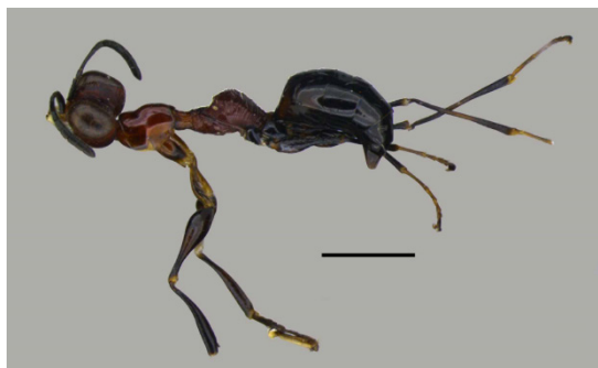
Figure 8. Gonatopus mariae sp. nov. Female. Habitus (Holotype), scale bar = 1mm.

in following proportions: 10:5:12:6:5:5:4.5:4:4.5:6.5. Head excavated, dull, granulated; frontal line incomplete, absent near the clypeus (Figure 9); POL= 1; OL= 3; OOL= 8; occipital carina shortly present on sides of posterior ocelli, laterally not reaching the eyes (Figure 9). Palpal formula 6/3. Pronotum shiny, smooth, crossed by strong transverse furrow