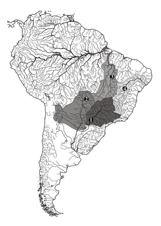
Figure 1. Sample collection sites of the piranha genera Serrasalmus and Pygocentrus in Brazil. Numbers correspond to the local sample of the respective river basin: (1) Upper Paraná River; (2) Upper Paraguay River; (3) Tocantins River; and (4) São Francisco River.

Genomic DNA was isolated from muscle tissues using the phenol-chloroform protocol (Green and Sambrook, 2012). After DNA quantification, mitochondrial DNA fragments were amplified by Polymerase Chain Reaction