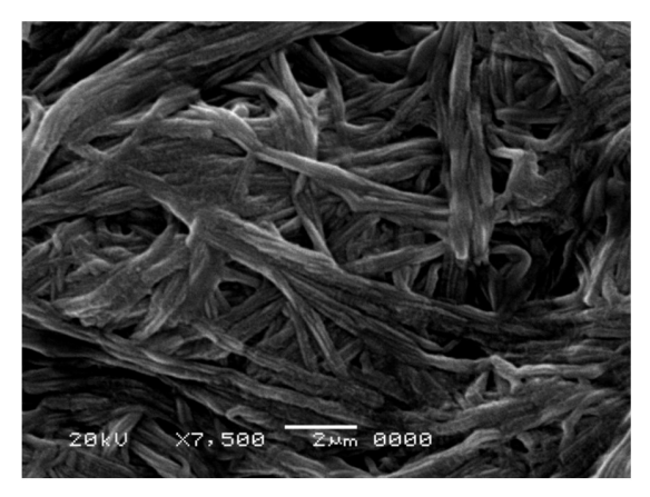
Figure 2. SEM image of prepared An-AgNPs.

Morphology of An-AgNPs was studied by SEM tool as shown in Figure 2. The particles are in bundles ranging in size 70-130nm (0.07-0.13µm). The size and dimensions of