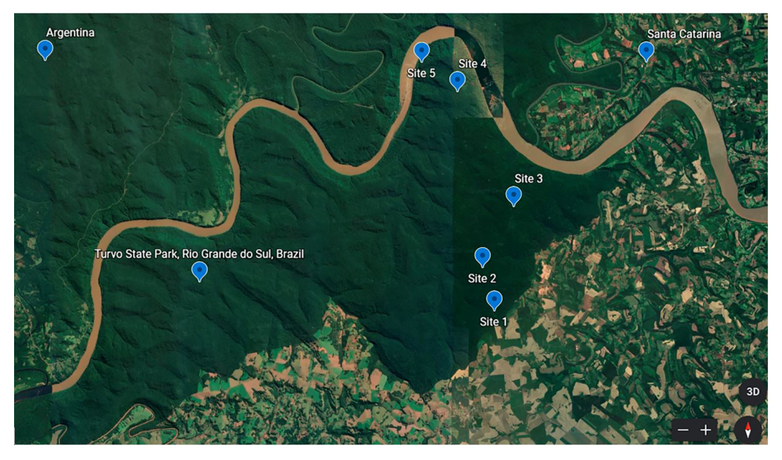
Figure 1. Distribution of sampled sites for the ant assemblages in the Turvo State Park, Rio Grande do Sul, Brazil, 2019.

Each pitfall consisted of a plastic cup with a capacity of 500 mL (10 cm in diameter and 12 cm in height), buried at ground level. In each trap it was added 150 mL of water with a drop of detergent to break the surface tension of the water. The canopy traps (pitfall) consisted of plastic cups with a capacity of 500 mL (10 cm in diameter and 12 cm in height), a drop of detergent and 1 g sardines, which were tied in trees with a diameter at breast height (DBH) of at least 30 cm. The sardine (~1 g) and glucose (~1 mL) baits were placed on 20 × 30 cm paper rectangles on the ground. Pitfalls remained in the environment for 72 hours and bait for one hour (Fernández, 2003; Baccaro et al., 2015).