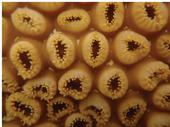
Figure 1. Colony of zoanthid Palythoa caribaeorum.

DNA was extracted from individual bacterial colonies using the thermal shock technique, in which a small quantity of material from each colony was collected and resuspended in 100 µl of ultrapure sterilized water, exposed to temperatures of 98 °C for 10 min. and -20 °C for 10 min. and subsequently centrifuged; the supernatants were transferred to sterile tubes.