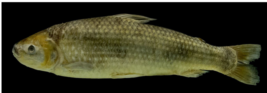
Figure 2. Megaleporinus macrocephalus , MZUEL 20221, 387.10 mm SL.