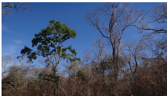
Figure 1. Evergreen tree species Goniorrhachis marginata during the dry season in a seasonally dry tropical forest at the Área de Proteção Ambiental do Rio Pandeiros, northern Minas Gerais, Brazil.

Though called evergreen trees, none of these species are truly evergreen. All retain their leaves for approximately 11.5 months of the year, when they shed all their leaves at the end of the dry season or beginning of the rainy season, and immediately replace them within a few days (Janzen and Waterman, 1984). The same is observed in Goniorrhachis marginata Taub. (Leguminosae-Caesalpinioideae), commonly known in Brazil as “Itapicuru” (Figure 1), a tree species that reaches up to 30 m in height (Oliveira-Filho, 2006). This species occurs in phytophysionomies marked by a severe dry season in Minas Gerais, Bahia and Pernambuco Brazilian states (Oliveira-Filho, 2006). At the SDTF of the present study, individuals shed their leaves in September, before the onset of the rainy season, whereas the flushing of young leaves is observed by the end of the same month (Pezzini et al., 2008). Furthermore, G. marginata is the only evergreen species recorded at local flora, and provides an ideal scenario to test for insect timing and herbivory attack related to resource availability and seasonality in SDTF.