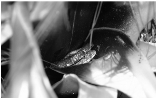
Figure 2. Abronia oaxacae inside the epiphytic bromeliad Tillandsia violacea , in the La Petenera site in El Punto, Santa Catarina Ixtepeji, Ixtlán, Oaxaca, Mexico.

incidence of light may increase considerably due to the deciduous nature of many of the live oaks in the area. The difference in temperature between exposed branches and branches close to bromeliads may reach up to four degrees centigrade, the same as the difference between the temperature on exposed branches and the temperature within the bromeliads (Stuntz et al., 2002). The Abronia specimens collected in this study were found deep within the leaves of the bromeliads, and were rolled up (Figure 2).