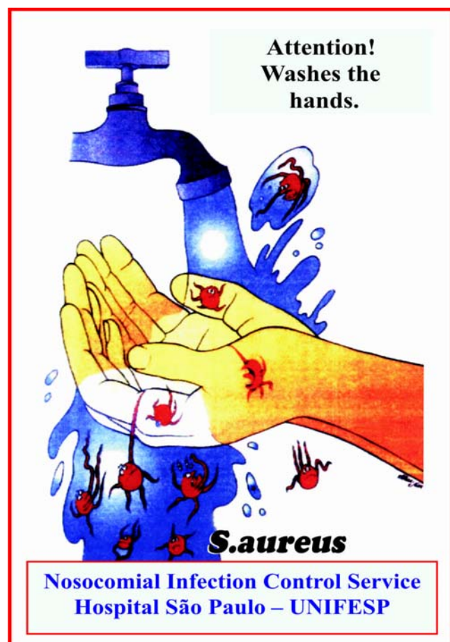
Figure 1. Identification card for MRSA patients.

November 1, 1997 through June 30, 1998. The microorganisms were kept under daily surveillance, isolated