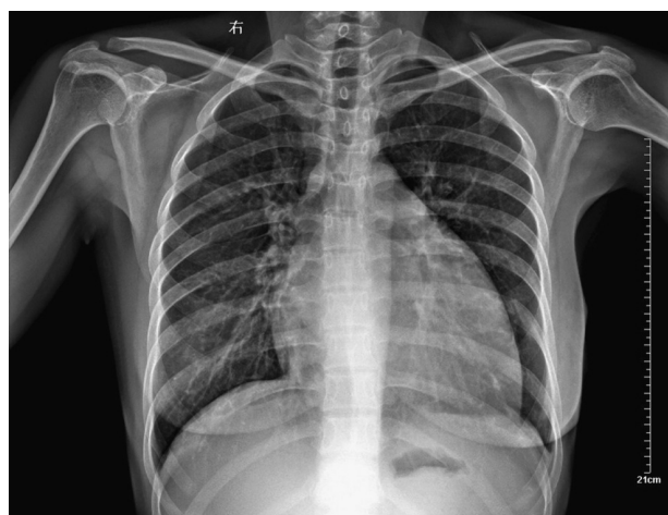
Fig. 1 – Chest radiography showed an enlarged and globular cardiac silhouette and pulmonary congestion without pleural effusion.

Physical examination revealed blood pressure of 130/90 mmHg, heart rate of 122/min, a dilated jugular vein, and an audible gallop rhythm and systolic ejection murmur. There was mild peripheral edema. Chest radiography showed an enlarged and globular cardiac silhouette and pulmonary congestion without pleural effusion (Fig. 1). Serum free T3, T4, total T3, T4 and thyroid stimulating hormone (TSH) were within normal values with levothyroxine replacement therapy at a dose of 50 \mu g daily. Cardiac enzymes, liver enzymes, erythrocyte sedimentation rate and C reactive protein were normal. Antinuclear, antithyropoxidase and antithyroglobulin antibodies were positive. Rheumatoid