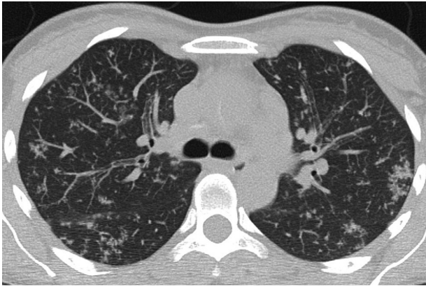
Fig. 4 – Atypical CT imaging features for COVID-19 pneumonia. Axial unenhanced chest CT image of the lungs in a 37-year-old control patient showing tree-in-bud opacities and centrilobular nodules, caused by active tuberculosis.