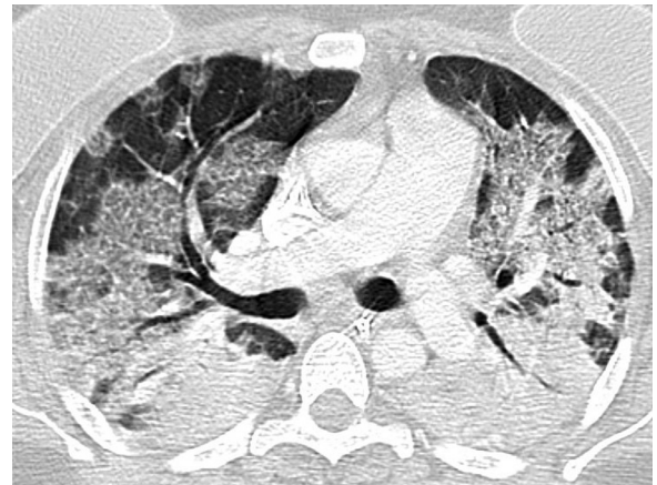
Fig. 3 – Indeterminate CT imaging features for COVID-19 pneumonia. Axial contrast-enhanced chest CT image of the lungs in a 41-year-old female with a positive RT-PCR, showing bilateral widespread GGO with nonrounded morphology and no specific distribution with areas of consolidation.

Another possible reason is the undervaluation of said symptoms in the pre-pandemic context, especially when of mild or vague nature, or even when linked with chronic conditions. Nevertheless, differential diagnosis is not restricted to infections of obvious presentation or of infectious etiology, 4 which in our opinion justifies the inclusion of patients without explicitly reported signs/symptoms. We also recognize that there is concern that the control patients and settings do not ideally match the review question, but we understand that it is an unavoidable issue given the case-control selection nature of the study. The limit of seven days between RT-PCR sampling and CT scanning for the COVID-19 group may also