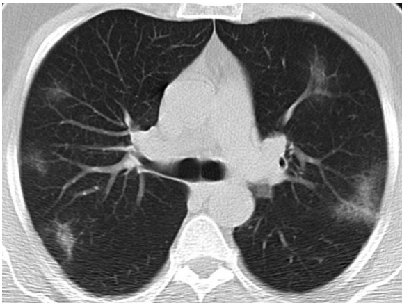
Fig. 2 – Typical CT imaging features for COVID-19 pneumonia. Axial unenhanced CT image of the lungs in a 61-year-old man with a positive RT-PCR showing bilateral, multifocal rounded and peripheral GGO.