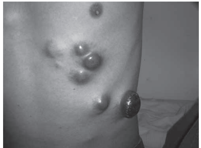
Figure 3. Multiple and reddish tumoral lesions on chest wall in a patient with plasmablastic lymphoma with cutaneous involvement..

(Figure 4). The EBV genome in the atypical cells was detected in 2 patients (one with immunoblastic and the other with plasmablastic lymphoma). The HHV-8 genome was also detected in the patient with plasmablastic lymphoma. Two patients could not receive chemotherapy due to rapid progression of illness or presence of other opportunistic diseases. One patient with perianal cutaneous lymphoma received antiretroviral treatment (ART) only. The other two were treated with ART plus chemotherapy based on CHOP (cyclophosphamide, doxorubicin, vincristine, and prednisone) completion of six cycles. The patient with plasmablastic lymphoma died after 6 months of being diagnosed with neoplasm. The other two are still alive with a complete remission of neoplasm disease, after 18 and 24 months, respectively. The main clinical features are summarised in Table 1.