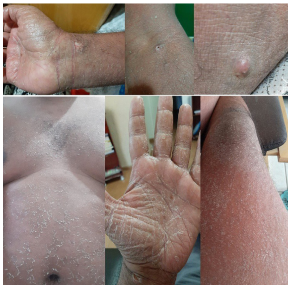
Fig. 3 – Exfoliation reached the entire skin, including scalp, palms of the hands and soles of the feet, and was associated with sparse pustules and hyperpigmentation, especially in skin fold regions.

aspartate amino transferase, 31–89 U/L; alkaline phosphatase, 162–169 U/L; increased serum C-reactive protein (2.95–3.40 mg/dL); bilirubins, glucose, lipase, amylase, calcium, magnesium, and creatine phosphokinase remained normal throughout the clinical evolution. Tests for dengue, hepatitis A, hepatitis B, cytomegalovirus, syphilis, and AIDS were non-reactive. The attempt to taper off corticosteroid therapy worsened the dermatological condition, with lichenification, pigmentation, and skin fissures over the joints. Weight loss, loss of muscle mass, generalized myalgia, weakness, and fasciculation in the limbs made walking difficult. The magnitude of the skin lesions and the acute hepatitis in the presence of SARS-CoV-2 infection, in addition to the use of carbamazepine, led us to consider overlapping pharmacotoxicity. Therefore, carbamazepine discontinuation started on D43, 2020, with marked improvement of the rash and progressive skin recovery. The patient did not show any respiratory changes since the onset of symptoms, maintaining O 2 saturation around 98%.