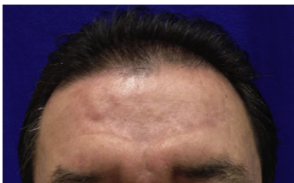
Fig. 2 – The disappearance of tubero-serpiginous syphilids on forehead after the end of treatment.