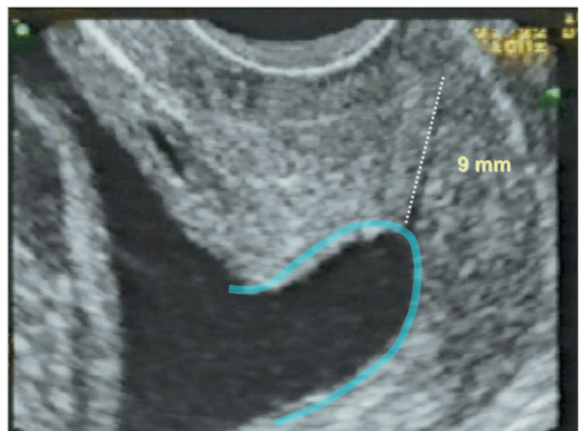
Figure 3. Short cervix (9 mm) with funneling.