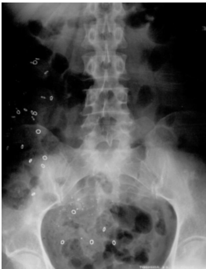
Figure 2 - Colonic inertia in a constipated patient with Chagas' disease (ChC). An X-ray obtained on day 7 shows stasis of the radiopaque markers in the ascending colon.

when a decrease of markers was observed on the X-ray. IC and ChC patients were divided according to total CTT into those with "normal transit" and those with "slow transit", the latter when total CTT was longer than 65 h (Figure 1). Slow colonic transit was shown in 65% of IC (11 out of 17, 10 females) and 27% of ChC (4 out of 15, 3 females; P = 0.03 ). There was no difference between slow transit IC and slow transit ChC patients in total CTT (Table 2). In addition, all patients with prolonged transit reported the chronic use of laxatives.