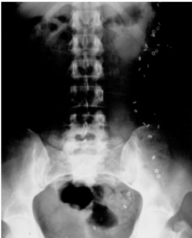
Figure 3 - Hindgut dysfunction in a patient with idiopathic constipation (IC). An abdominal X-ray taken on day 7 shows stasis of radiopaque markers in the left colon.

The proportion of slow colonic transit observed among our ChC patients was similar to that reported by Pemberton et al. (16) who found a demonstrable abnormality in