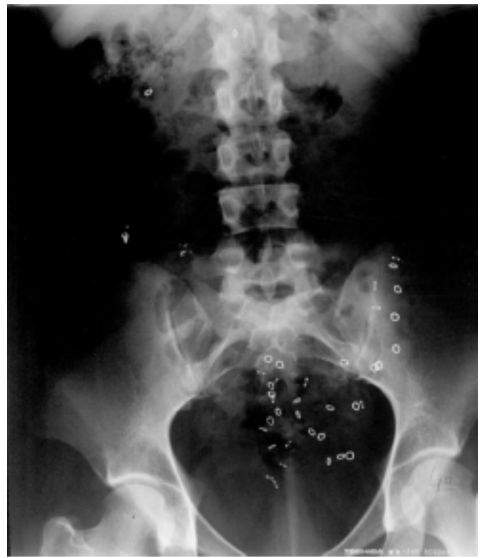
Figure 4 - Outlet obstruction in a patient with idiopathic constipation (IC). An X-ray taken on day 4 shows aggregation of markers in the rectosigmoid. The same pattern was observed on day 7.