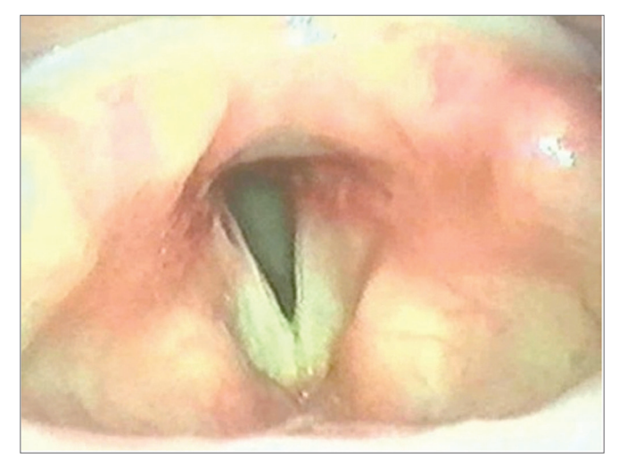
Figure 3. Post-operation - unilateral microtrapdoor flap.

The unilateral microtrapdoor flap technique was used in another eight cases of posterior glottic stenosis, as the incision facilitates dissection and better exposure of the stenotic scar. This technique was effective in 100% of cases; it was associated with subtotal arytenoidectomy in two of the type III posterior glottic stenosis cases (Figure 3).