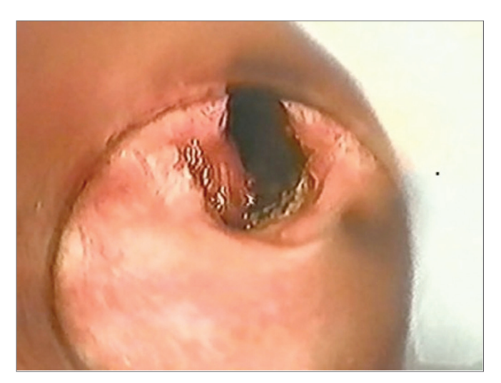
Figure 2. Unilateral microtrapdoor flap: posterior glottic stenosis grade III.

posterior glottic stenosis involving one of the cricothyroid joints, as described by Remacle.<sup>9</sup>