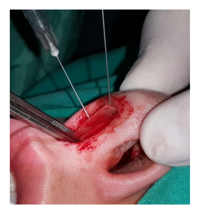
Application of caudal septal extension graft Figure 3 (CSEG).