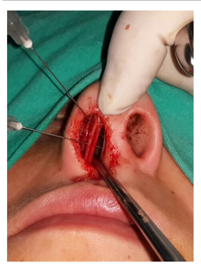
Figure 4 Application of caudal septal extension graft (CSEG).