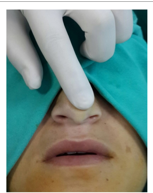
Figure 1 Recoil maneuver.

All patients were evaluated pre- and postoperatively with acoustic rhinometer with and without topical nasal decongestant (RhinoMetrics SRE2000, Interacoustics AS – DK.5610, Assens, Denmark) and they were requested to complete the Nasal Obstruction Symptom Evaluation (NOSE) (Table 1) and the Rhinoplasty Outcome Evaluation (ROE) questionnaires (Table 2) pre- and postoperatively. Pre-operatively