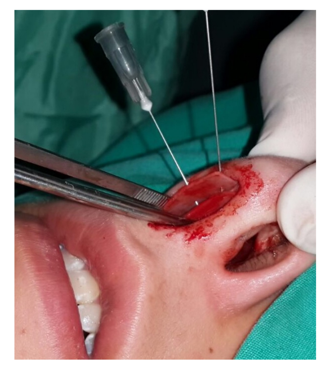
Application of caudal septal extension graft Figure 2 (CSEG).

Data were analyzed using SPSS v. 21 (SPSS Inc., Chicago, IL, United States). Age distribution of the subjects in the groups was analyzed with Student's t -test and sex distribution analysis utilized the chi-squared test. Comparative analysis of average scores for MCA1, VOL1, and the results of the questionnaire evaluating nasal obstruction and rhinoplasty outcome as assessed by the NOSE and ROE scoring systems was carried out using the Wilcoxon test. Postoperative average MCA1 and VOL1 values in the different groups were analyzed with the Mann-Whitney U test. Changes in the nasolabial angles of the patients were measured based on lateral photographs of the patients in different groups and analyzed using Student's t -test for dependent groups. All differences associated with a chance probability of 0.05 or less were considered to be statistically significant.