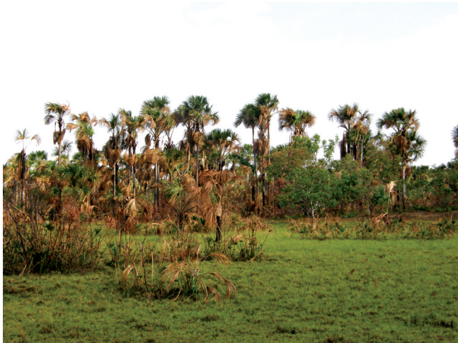
Figure 3. A vereda modified by burning targeting regrowth of grasses at Parque Nacional das Nascentes do Rio Parnaíba, in northern Cerrado (Piauí state), Brazil.

Figura 3. Uma vereda modificada por queimada visando a rebrota de gramíneas no Parque Nacional das Nascentes do Rio Parnaíba, na região norte do Cerrado (estado do Piauí), Brasil.