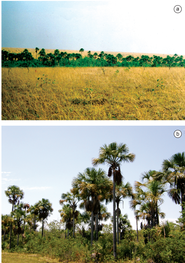
Figure 2. Veredas at a) Parque Nacional das Emas; and b) Estação Ecológica de Uruçuí-Una, in the Brazilian states of Goiás and Piauí, respectively. Their linear format, buriti palms ( Mauritia flexuosa ) as emergent trees, numerous trees and shrubs and a dense herbaceous layer can be noted.

Figura 2. Veredas situadas a) no Parque Nacional das Emas; e b) na Estação Ecológica de Uruçuí-Una, nos estados brasileiros de Goiás e Piauí, respectivamente. Seu formato linear, palmeiras buritis ( Mauritia flexuosa ) como árvores emergentes, numerosas árvores e arbustos, e um denso estrato herbáceo podem ser notados.