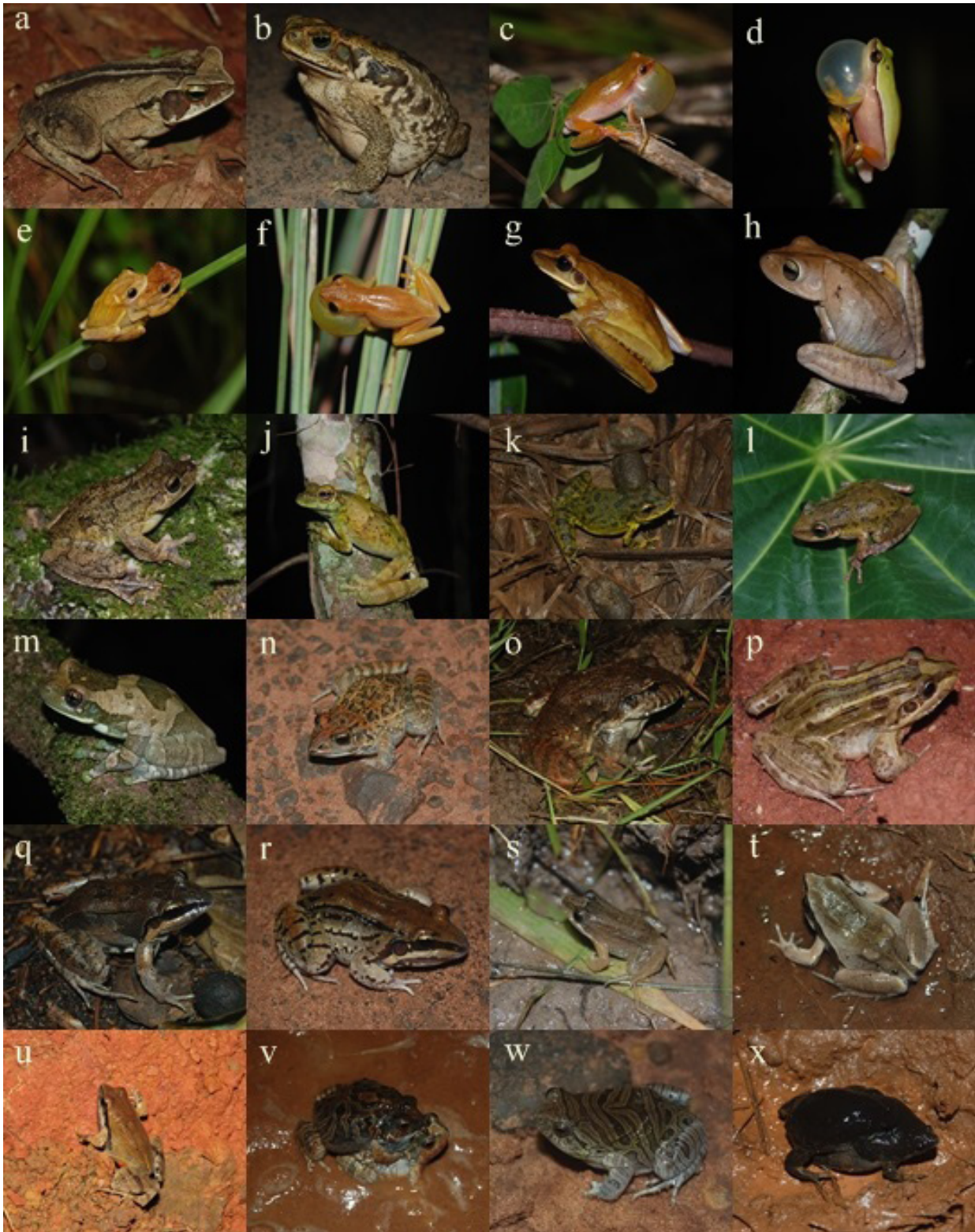
Figure 3. Anuran species recorded in the Vassununga State Park, northeastern São Paulo state, Brazil. In brackets, for each vouchered specimen we provide the acronym of the Coleção de Anfíbios do Departamento de Zoologia da Universidade Estadual Paulista, municipality of Rio Claro (CFBH) followed by the registration number and the snout-vent length (SVL). a = Rhinella ornata (CFBH 40455; SVL 38.18 mm), b = R. schneideri (CFBH 38871; SVL 124.39 mm), c = Dendropsophus elianae , d = D. jimi (CFBH 40456; SVL 24.03 mm), e = D. minutus , f = D. nanus (CFBH 38872; SVL 19.07 mm), g = Hysiboas albopunctatus (CFBH 38856; SVL 52.74 mm), h = H. faber , i = H. lundii (CFBH 38870; SVL 64.8 mm), j = Itapotihyla langsdorffii , k = Scinax fuscovarius (CFBH 38862; SVL 39.23 mm), l = S. similis (CFBH 40455; SVL 38.18 mm), m = Trachycephalus typhonius (CFBH 38866; SVL 31.87 mm), n = Leptodactylus fuscus (CFBH 38869; SVL 33.98 mm), o = L. labyrinthicus , p = L. latrans , q = L. mystaceus , r = L. mystacinus (CFBH 38859; SVL 55.95 mm), s = L. podicipinus , t = Physalaemus centralis (CFBH 40457; SVL 33.68 mm), u = P. cuvieri (CFBH 38912; SVL 28.71 mm), v = P. marmoratus (CFBH 38865; SVL 37.05 mm), w = P. nattereri (CFBH 38867; SVL 41.48 mm), x = Elachistocleis cesarii .