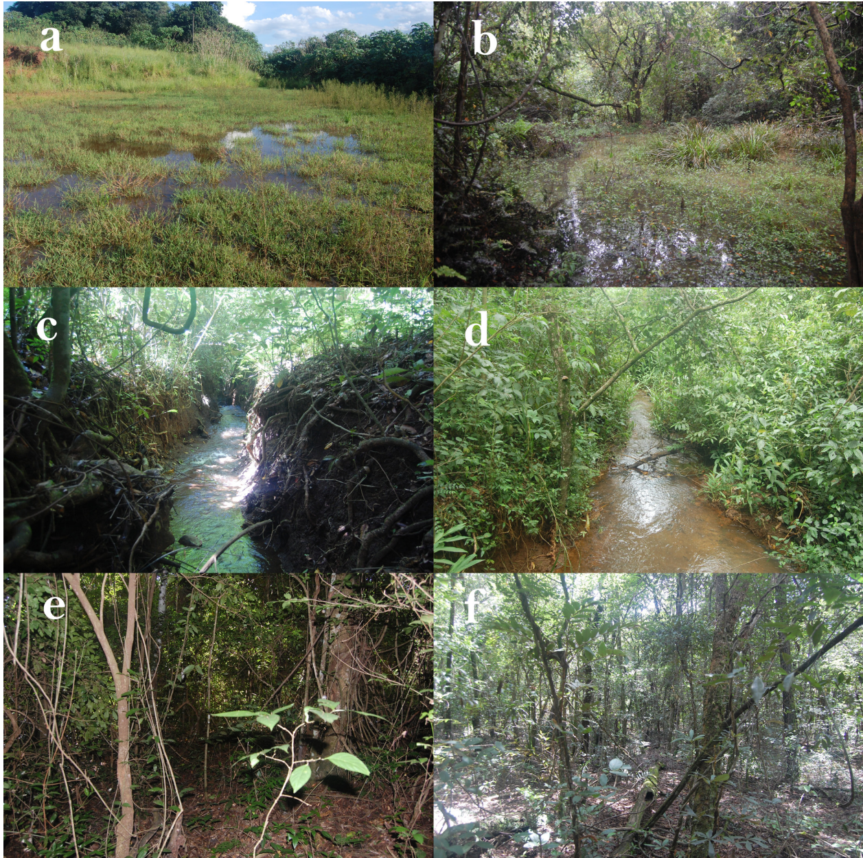
Figure 2. Sites sampled in the Vassununga State Park: (a) temporary pond in open area (TP1; 21°43'9.83"S, 47°38'44.5"W), (b) temporary pond within gallery forest (TP2; 21°43'52.6"S, 47°35'3.6"W), (c) stream within gallery forest (S1; 21°38'59.3"S, 47°38'23.1"W), (d) stream within gallery forest (S2; 21°43'14.6"S, 47°35'45.4"W), (e) transect in the Cerradão formations (T1; 21°36'35.3"S, 47°37'22.2"W), and (f) transect in Cerradão formations (T2; 21°43'29.8"S, 47°35'42.7"W).

19 h to 24 h, while for visual encounter survey, we walked slowly inside the forest fragment (transects) or around ponds and streams for 30 min looking for individuals hidden under trunks, bromeliads, stones, branches, and leaf litter. All collected specimens were anesthetized and killed with 10% lidocaine (spray solution), fixed in 10% formaldehyde, and stored in 70% ethanol. All specimens are housed in the Coleção de Anfíbios do Departamento de Zoologia da Universidade Estadual Paulista (CFBH), municipality of Rio Claro, São Paulo state, Brazil.