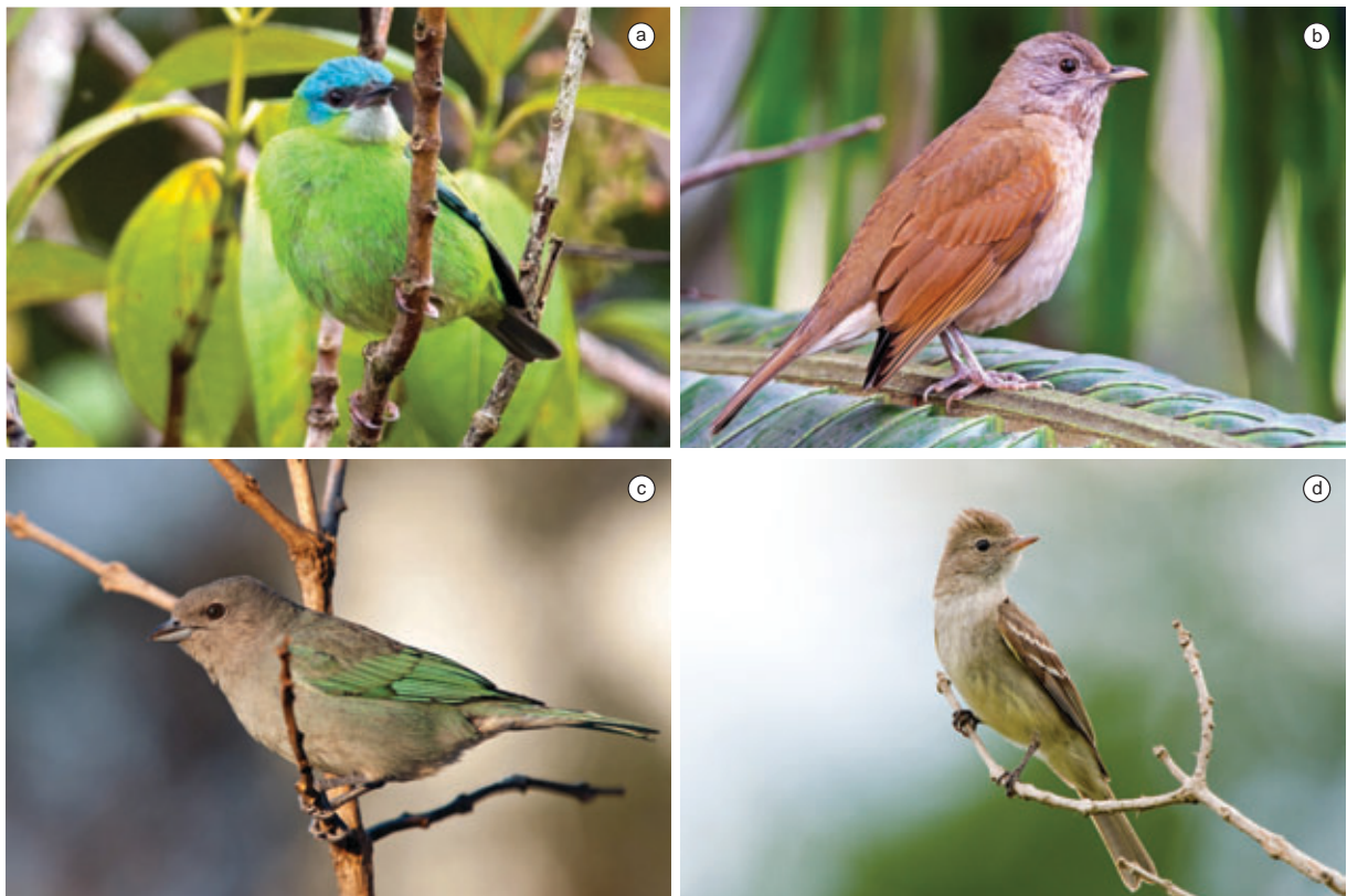
Figure 2. Some birds recorded in this study. a) Female Blue Dacnis ( Dacnis cayana ), the most frequent visitor among the visitors of Myrsine lancifolia , during 2007/08 observations; b) Pale-breasted Thrush ( Turdus leucomelas ), fed of Myrsine umbellata during the two periods of this study and consumed the highest of number of fruits during the 86/88 period; c) Sayaca Tanager ( Thraupis sayaca ) visited the two species of Myrsine spp.; d) Lesser Elaenia ( Elaenia chiriquensis ), migrant living in the study area during spring and summer.