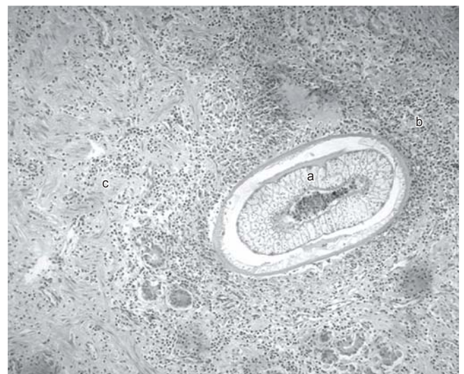
Figure 3. Microscopic view (H.E., 100X) of pyloric stomach of Peponocephala electra specimen. a) Cross cut of Anisakis typica parasite. b) Granulomatous reaction with the presence of eosinophils and giant cells around the parasite. c) Chronic lymphoplasmocytic gastritis with fibrosis and necrosis.

Figura 2. Estômago pilórico de um espécime de Peponocephala electra : mucosa edemaciada, hiperêmica, com 4 úlceras (1,0 a 1,5cm de diâmetro) contendo tecido necrosado e Anisakis spp. aderidos.