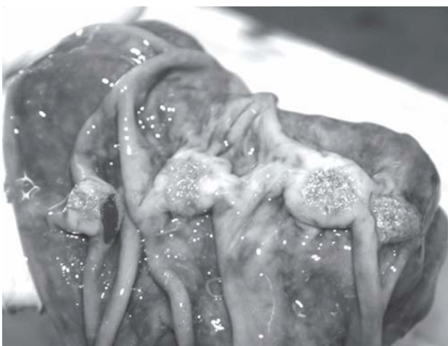
Figure 2. Pyloric stomach mucosa of a Peponocephala electra specimen, with edema, hyperemia, and four ulcers (from 1.0 to 1.5 cm in diameter) containing necrotic tissue and Anisakis spp. specimens embedded.

Most reports of ulceration in marine mammals directly associate the ulcers with parasitism by nematodes, e.g. Anisakis sp., Contracaecum osculatum , Pholeter gastrophilus and Phocanema decipiens . Parasite-induced ulcers are typically shallow and have the anterior end of the worm embedded in the ulcer bed, but in some cases there may be numerous adult and larval Anisakine parasites free within the lumen (Geraci & St. Aubin 1987). In this study, from the ten animals that had parasitic infection by Anisakis spp., seven showed gastric alterations and only three of these presented visible parasites embedded in the ulcerous regions. Moeller (2001) believe that these