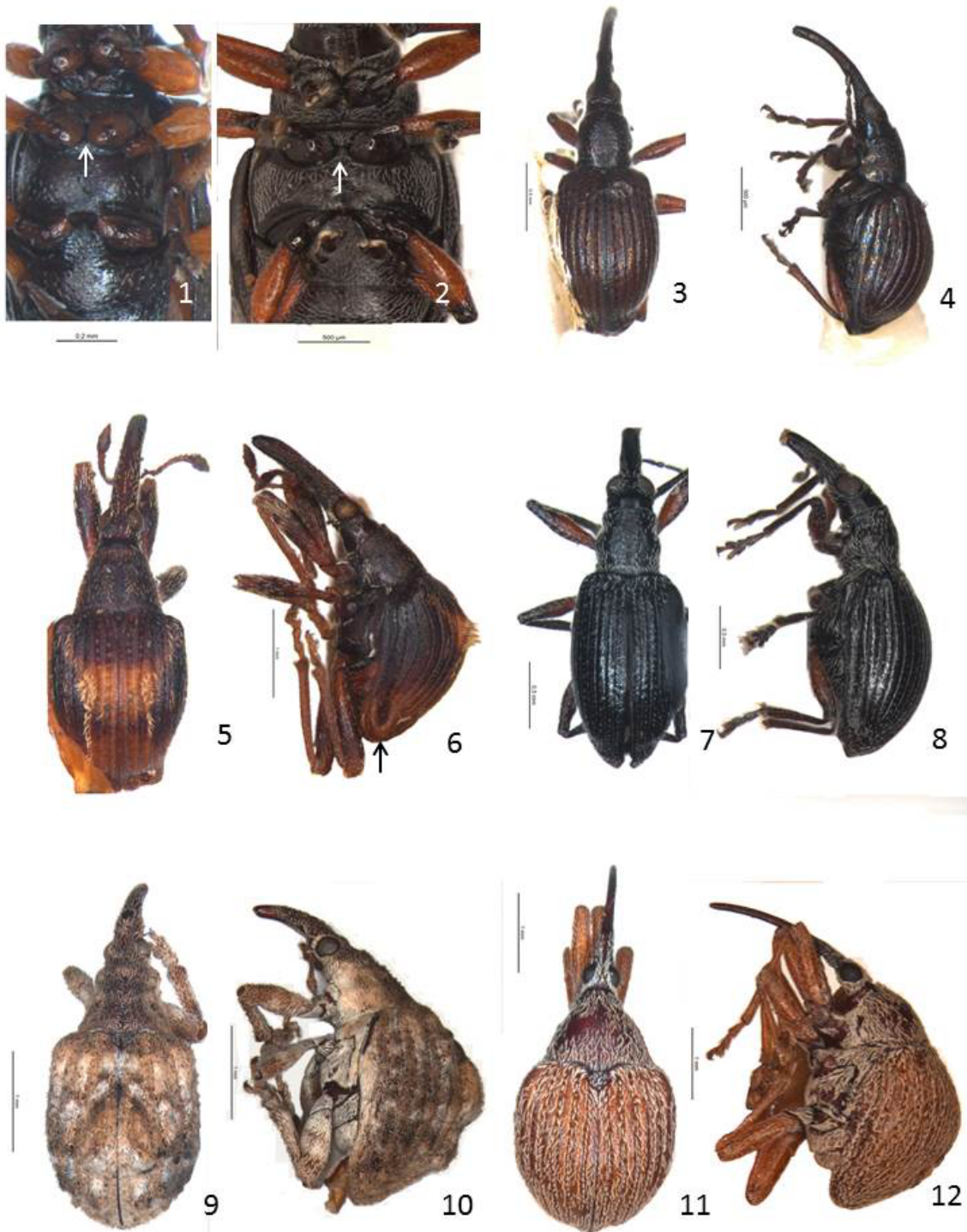
Figures 1-12. Chrysapion sp.: 1, prothorax, meso- and metaventre ventral view; 3, dorsal view; 4, lateral view. Trichapion sp.: 2, prothorax, meso- and metaventre ventral view. Bothryopteron binodosum (Wagner): 5, dorsal view; 6, lateral view. Stenapion sp.: 7, dorsal view; 8, lateral view. Neapion (Neotropion) marquesae De Sousa & Ribeiro-Costa: 9, dorsal view; 10, lateral view. Coelopterapion testaceum (Wagner): 11, dorsal view; 12, lateral view.