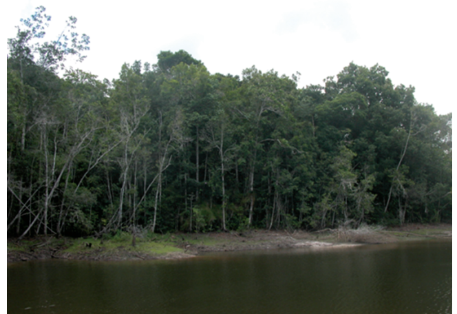
Figure 2. Photo of Mata do Açude in Usina São João representing the vegetation types where Oecomys catherinae was collected during field work.

In the Brazilian Atlantic Forest we found individuals identified as O. catherinae occurring from Joinville, in the state of Santa Catarina, the type locality (Cherem et al. 2004, Carleton et al. 2009), to the state of Espírito Santo (Pinto et al. 2009a, b). However, although Musser & Carleton (2005) and Costa et al. (2008) state that O. catherinae occurs from the states of Santa Catarina to Bahia, the only register of