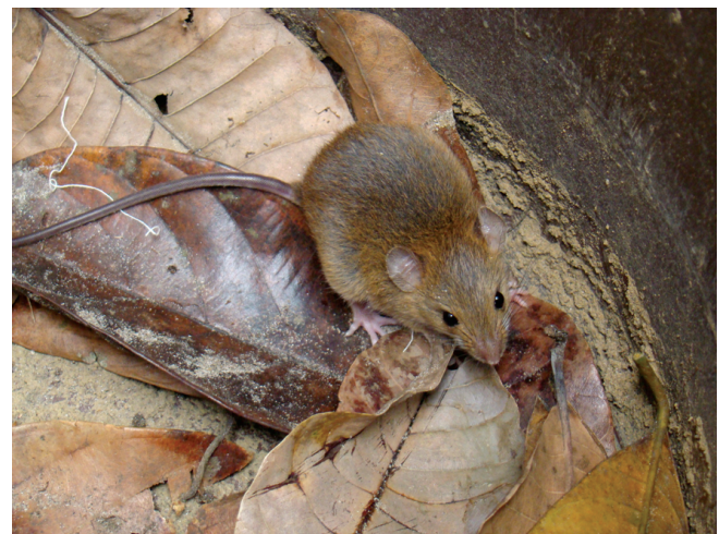
Figure 1. Individual of Oecomys catherinae (UFPE1890) trapped in Guaribas Biological Reserve. Juvenile male.

Live-traps (Sherman® of three different sizes: height: 10/7.5/10 cm, width: 8/9/11 cm, depth: 30.5/23/38 cm and Tomahawk® height: 15 cm, width: 14 cm, depth: 41 cm) were