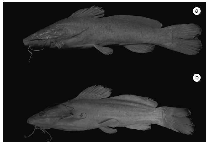
Figure 1. Specimens of Rhamdia branneri (a) and Rhamdia voulezi (b), NUP 10849 (SL= 111.58 mm) and NUP 2426 (SL= 90.74 mm), respectively.

In addition, a discriminant analysis (DA) was made using the forward-stepwise method with the aim to verify which morphological indices maximize the differences between the species. Similarly to