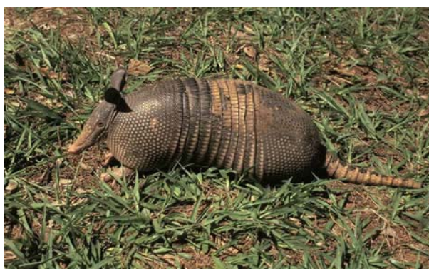
Figure 3. The nine-banded armadillo ( Dasypus novemcinctus ).

Twenty-four (35.3%) items were plant material and 44 (64.7%) were animal material (see Appendix). By frequency of occurrence, the wolf consumed plant and animal items in similar proportions (49.3% and 50.7%, respectively; Table 1). Even though the sample portrays the diet of a few individuals, these results are in the range shown in other studies (Dietz 1984, Motta-Junior et al. 1996, Motta-Junior 2000, Aragona & Setz 2001), which also described a typically omnivorous diet for this canid. The most consumed items in our study (Table 1) were rodents (22.5%) and miscellaneous fruits (20.6%). In contrast, according to the biomass ingested, the most important items were armadillos (36.2%) and wolf's fruits (19.6%) (Figs. 3 and 4, respectively) (Table 1). Although the most abundant armadillo species at ESI were Cabassous unicinctus and Euphractus sexcinctus (Bonato 2002), the maned wolf consumed mainly Dasypus spp. (see Appendix). It is possible that the low incidence of C. unicinctus in the wolf's diet is due to its primarily diurnal habits (Bonato 2002) and its fast-digging ability (Redford