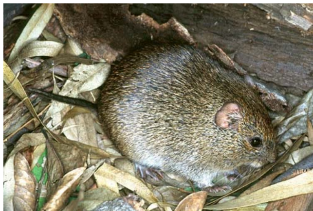
Figure 7. The spiny rat Clyomys bishopi .