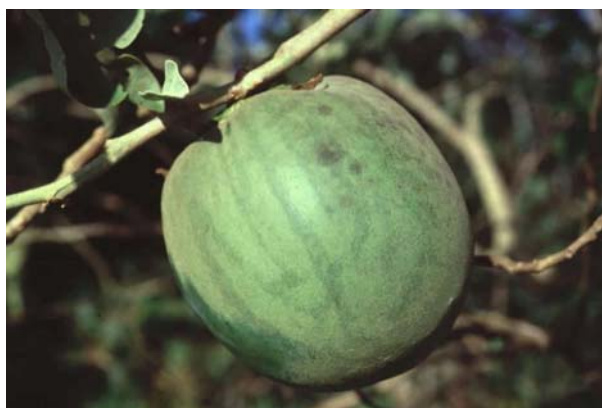
Figure 4. The wolf's fruit ( Solanum lycocarpum ).

1994). The lack or low consumption of the diurnal-nocturnal E. sexcinctus (Bonato 2002) noted at ESI (this study) and reported for other areas (Motta-Junior et al. 1996, Motta-Junior 2000, Belentani 2001) may be explained by an escape strategy that includes mainly running and secondarily digging (Redford 1994). On the other hand, Dasypus spp. (Fig. 3) is commonly reported in the maned wolf's faeces, even though they were not frequently found at ESI (Bonato 2002), suggesting higher vulnerability to predation or selection by the wolf.