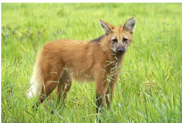
Figure 1. The maned wolf ( Chrysocyon brachyurus ).

The objective of the present study was to quantify the maned wolf’s diet as expressed by: frequency of occurrence as a percentage of total occurrences (Dietz 1984), the minimum number of consumed individuals (Emmons 1987), and the estimated biomass ingested (Emmons 1987, Motta-Junior et al. 1996). We also investigated if there was any seasonality in the consumption of major groups of food items. Additionally, aspects of prey size distribution and the importance of savannah-like habitats as a source of food for the maned wolf were considered.