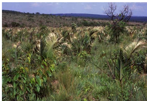
Figure 2. Grassland savannah (“campo sujo”) at ESI.

Fieldwork was conducted from January 1998 to May 2002 in the 2,300 ha Ecological Station of Itirapina (ESI, 22°15' S; 47°49' W) and adjacent areas, São Paulo State, Brazil. The climate is rainy/tropical, with two distinct seasons (Köppen’s Cwa). The mean annual rainfall is 1,388.7 mm, defining a wet season from October to March (105 to 311 mm monthly), and a dry season from April to September (18 to 85 mm) (RIPASA S/A Meteorological Office, Fazenda Seriema, Brotas, SP). The elevation ranges from 705 m to 750 m (SEMA 2000). The ESI protects one of the last remnants of natural cerrado (mostly as savannahs and grasslands) in São Paulo State. The vegetation includes grassland (“campo limpo”), grassland savannah (“campo sujo”, see Fig. 2, and “campo cerrado”), and savannah (“cerrado”) (see Coutinho 1978). Marshes and gallery forests are also found in the area (Mantovani 1987). Plantations of Pinus sp., Eucalyptus sp. and Citrus sp., besides pastures surround the ESI.