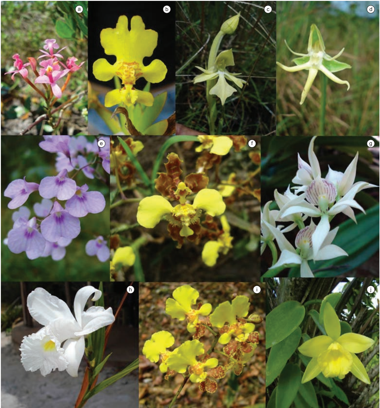
Figure 3. Some species of orchids in Sergipe. a. Epidendrum secundum, b. Erycina pusilla, c. Habenaria pratensis, d. Habenaria trifida, e. Ionopsis utricularioides, f. Gomesa barbata, g. Prosthechea aemula, h. Sobralia liliastrum, i. Trichocentrum cebolleta, j. Vanilla palmarum.

contribute to our knowledge about the species and distribution of a taxonomic group.