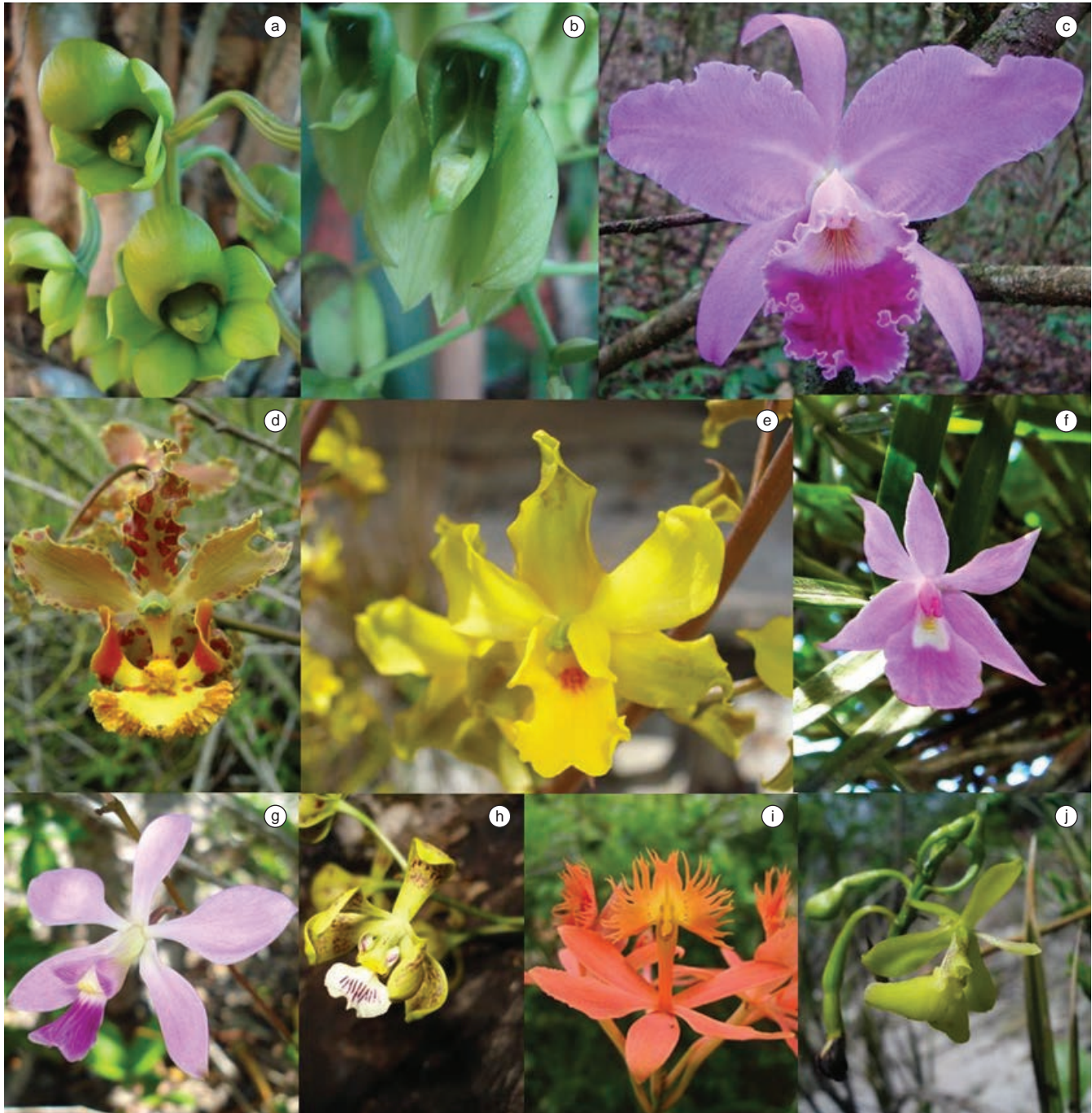
Figure 2. Some species of orchids in Sergipe. a. Catasetum hookeri , b. Catasetum purum , c. Cattleya labiata , d. Cyrtopodium holstii , e. Cyrtopodium polyphyllum , f. Dimerandra emarginata , g. Encyclia dichroma , h. Encyclia oncioides , i. Epidendrum cinnabarinum , j. Epidendrum orchidiflorum .

Habenaria (10 spp.), which was very common in fields (Batista & Bianchetti 2003, Batista et al. 2005, Rocha & Waechter 2006).