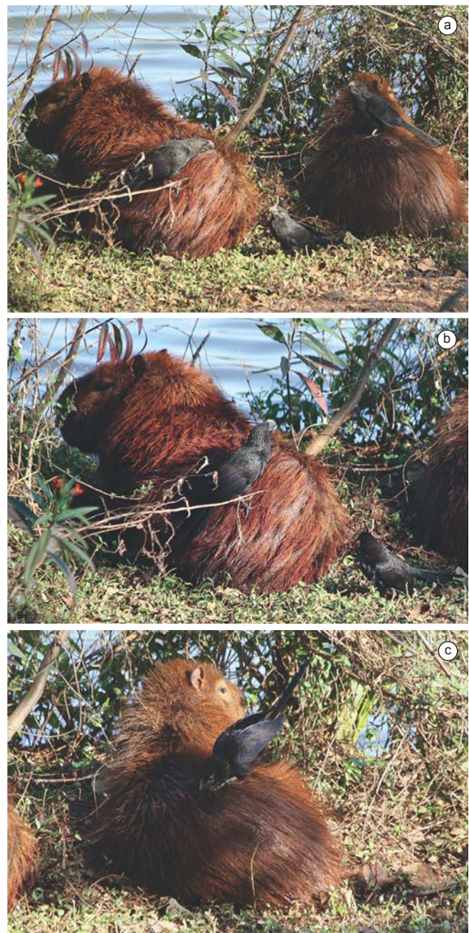
Figure 1. A male (on the left) and a female capybara ( Hydrochoerus hydrochaeris ) at rest and attended by smooth-billed anis ( Crotophaga ani ) at a lake margin in Campinas, São Paulo, southeastern Brazil (a) - the bird on the left inspects a tick on the male's back; the same ani individual swallows the tick it was inspecting (b); another ani individual vigorously pulls out a tick it found on the back of the female (c) - note the bird's posture while removing the tick.

When I reached the capybaras' place the anis were already perched on, and on the vegetation or the ground around, their two resting clients (Figure 1a). Thus, I have no idea of the time and circumstances the birds began to clean the capybaras. Nevertheless, the anis were still very active inspecting the capybaras' haired or hairless skin as well as healing and open sores, and remained with their clients for additional 48 min. I counted seven birds in the attending group, two to three of them working perched on the capybaras and additional one to two individuals worked while on the ground (Figures 1a, b, and 2c). The remaining birds were either foraging on the ground or sunning themselves on the vegetation.