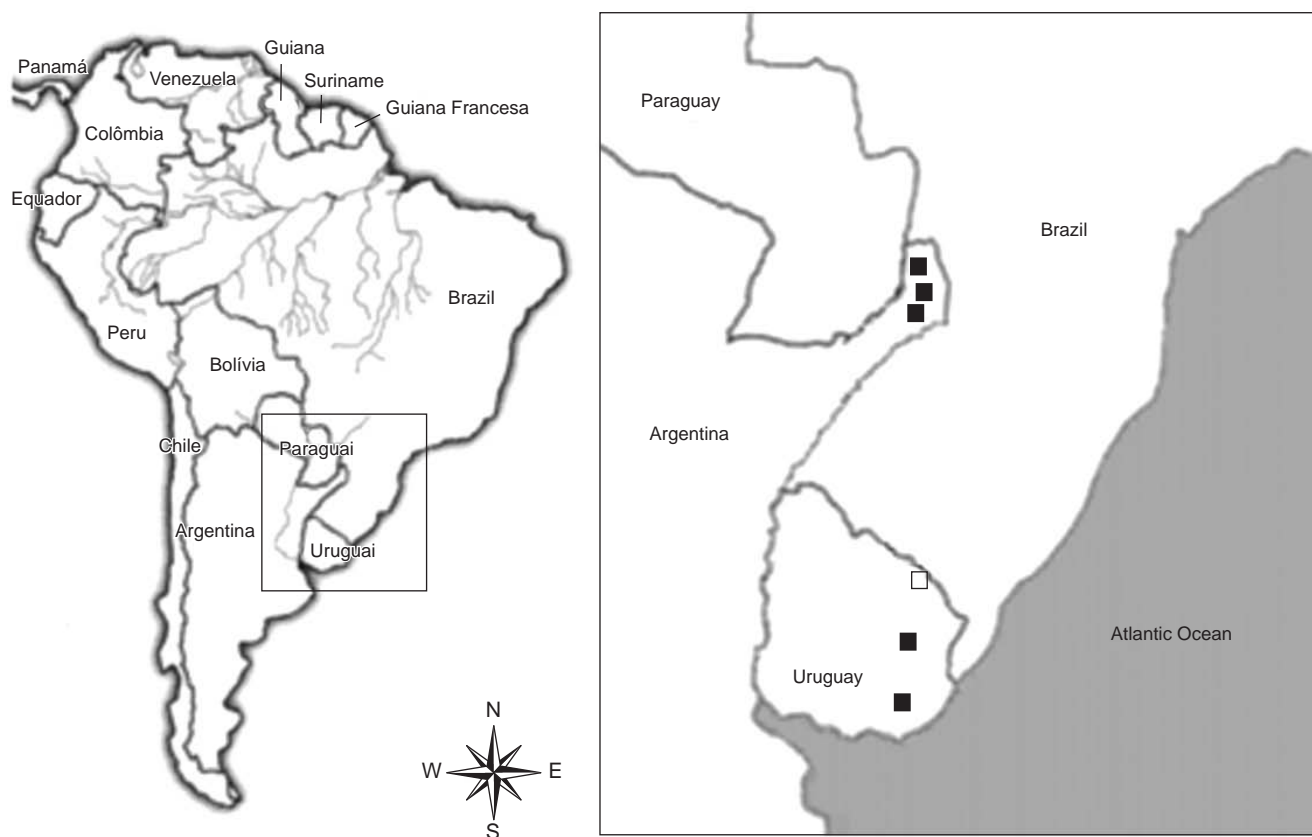
Figure 1. Distribution records for Scinax aromothyella . In the map the symbol ■ shows records from previous works (mentioned in the text) and the symbol □ shows the site of the new record in present work.

Tadpoles were collected, with a drag net of 5 mm mesh, in a temporal pond of 2,300 m 2 area, and a maximum depth about 1 m. The pond is located in a high disturbed area, a cattle farmland next to slaughterhouse facilities. The vertebrate community at this pond was solely represented by anurans. Other tadpoles found in the sample were Hypsiboas pulchellus , Scinax sp., Pseudis minutus and Dendropsophus minutus . S. aromothyella represents less than 0.6% of total tadpole density in the sample. At the same locality we sampled other ponds and creeks, in a diameter of 500 m, but we didn't find any other S. aromothyella specimens. The specimens are fixed in 10% formalin dilution and stored at the Vertebrate Zoology Collection, Facultad de Ciencias, Universidad de la República, Uruguay (ZVCB 16610).