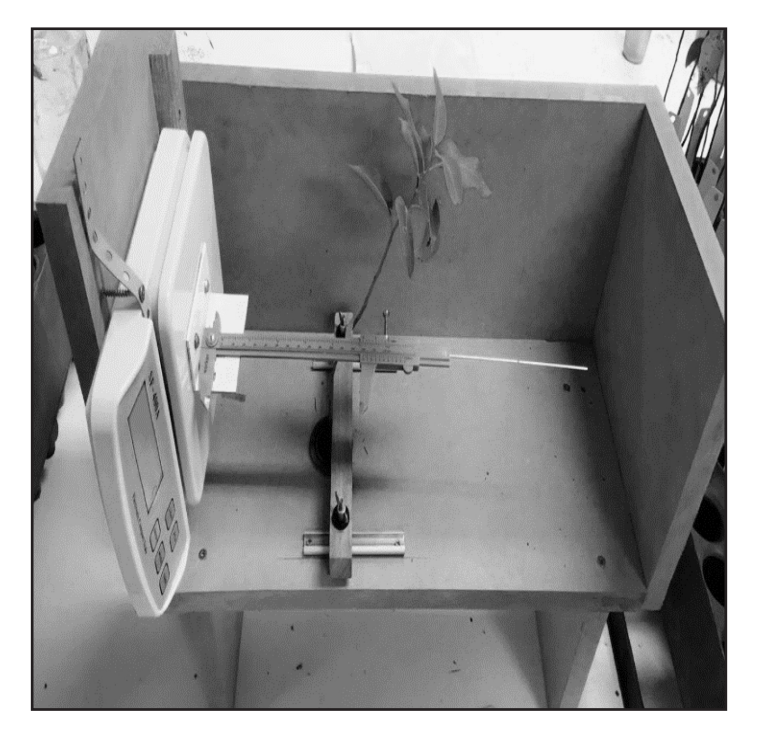
Figura 1 - Aparato construído para quantificação da resistência do caule em mudas