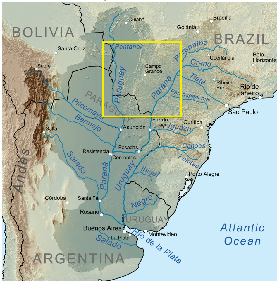
Figure 1: The Plata River basin

The Guarani 4 originally inhabited a vast territory ranging from the shores of Uruguay to the Brazilian state of Rio de Janeiro, extending westwards up to today's Bolivia and Paraguay, and southwards towards Argentina. This article refers to the history and the current situation of Guarani-speaking people living between the Paraguay and Paraná Rivers (see Figure 1), in what is now the Brazilian state of Mato Grosso do Sul. 5