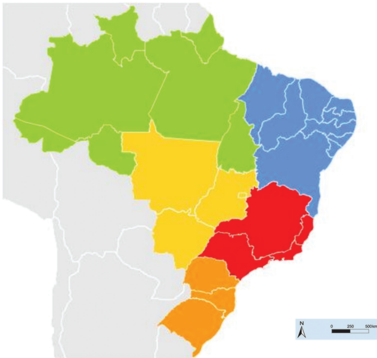
Figure 1 - Geo-political map of Brazil, with colored representations of its geographic regions (green for North, blue for Northeast, red for Southeast, yellow for Central-West and orange for South).