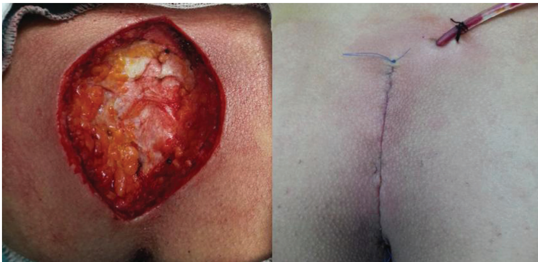
Figure 3 - Karydakis flap rotation.

3. Patient presenting with different conditions mimicking pilonidal sinus.