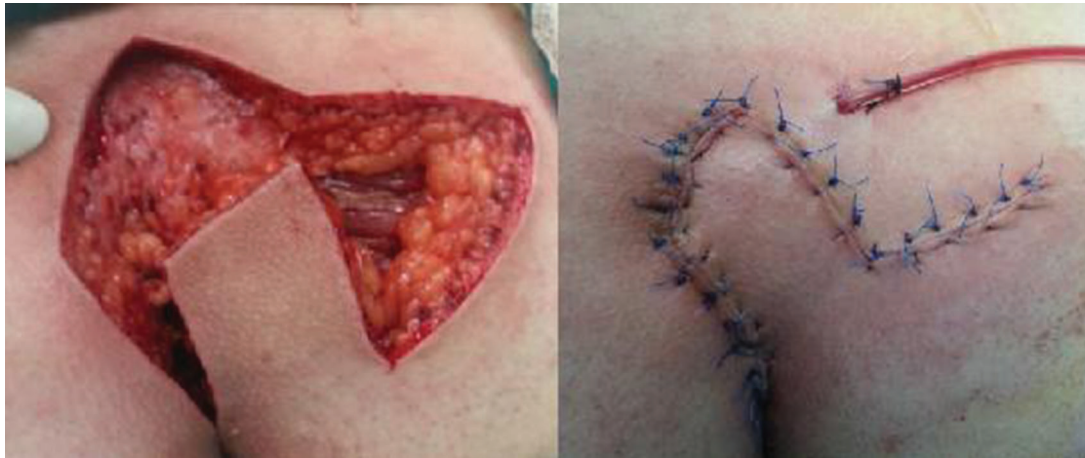
Figure 2 - Limberg flap technique.