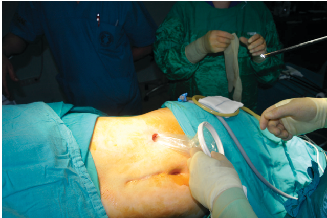
Figure 1 - Glove port preparation.