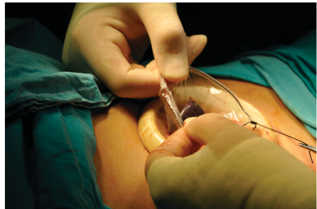
Figure 4 - The spleen was placed in a 15-mm bag, crushed, and removed from the abdominal cavity through the ALEXIS port.