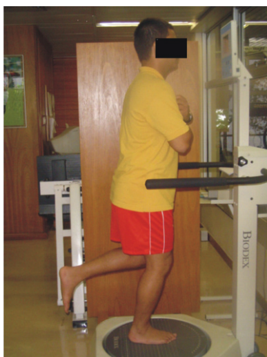
Figure 1 - The Biodex Balance System.

Each patient was positioned barefoot on the platform in unipodal support with a 10° semi-flexed knee. The contra lateral knee remained flexed at 90° with the patient's arms crossed over his chest, looking at the screen in front. The platform was released, and the patient was instructed to keep himself balanced with the indicator in the center of the target on the screen. When the patient was capable of keeping the indicator in the center of the target on the screen (balance position) without hand support, the position of the feet was recorded using the platform rail (Figure 1).