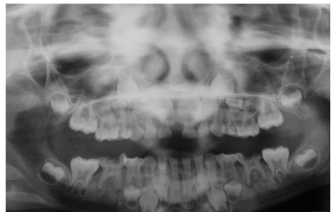
Figure 2 - Panoramic radiograph of a 7-year-old patient at diagnosis who was submitted to chemotherapy and 2,100 cGy irradiation. Note agenesi of the lower right second premolar, taurodontism of the first permanent molars and microdontia of the upper and lower left premolars.