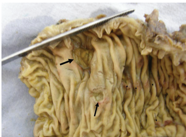
Figure 1 - Thick arrows indicate ulcers and thin arrows indicate macroscopic mucosal erosions

Mesalazine and anti-tumor necrosis factors such as infliximab and thalidomide have been used for intestinal BD on a limited basis. 15 The effectiveness of therapy on