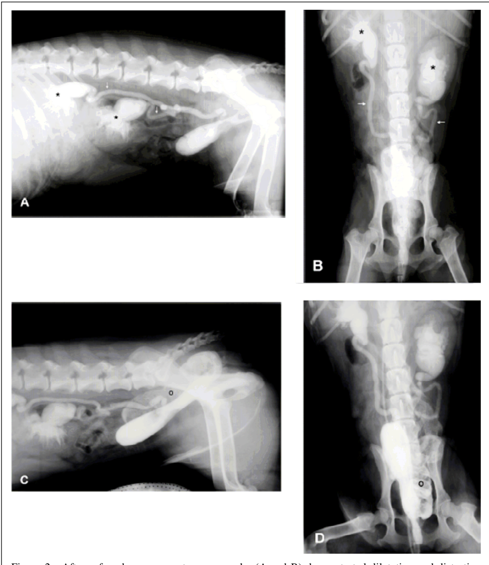
Figure 2 - After a few days an excretory urography (A and B) demonstrated dilatation and distortion of kidneys pelvis and recesses (*) with abnormal distention of the ureteres (arrows), identifing hydronephrosis and hydroureter bilaterally. An additional urethrocistography (C and D) showed contrast reaching the rectum (o), confirming that the fisutla was still open.

injection at the dose of 2ml kg<sup>-1</sup>. The catheter was maintained until the end of the procedure with slow administration of physiological solution 0,9% to provide a readily accessible route in the event of systemic reactions. Radiographs were obtained immediately and 5, 20, and 40 minutes after the injection of the contrast media. This study was able to identify dilatation and distortion of the kidneys pelvis and recesses with abnormal distention of the ureteres. These findings were compatible with bilateral hydronephrosis and hydroureter (Figure 2A and B). A second urethrocistography confirmed the fistula (Figure 2C and D).