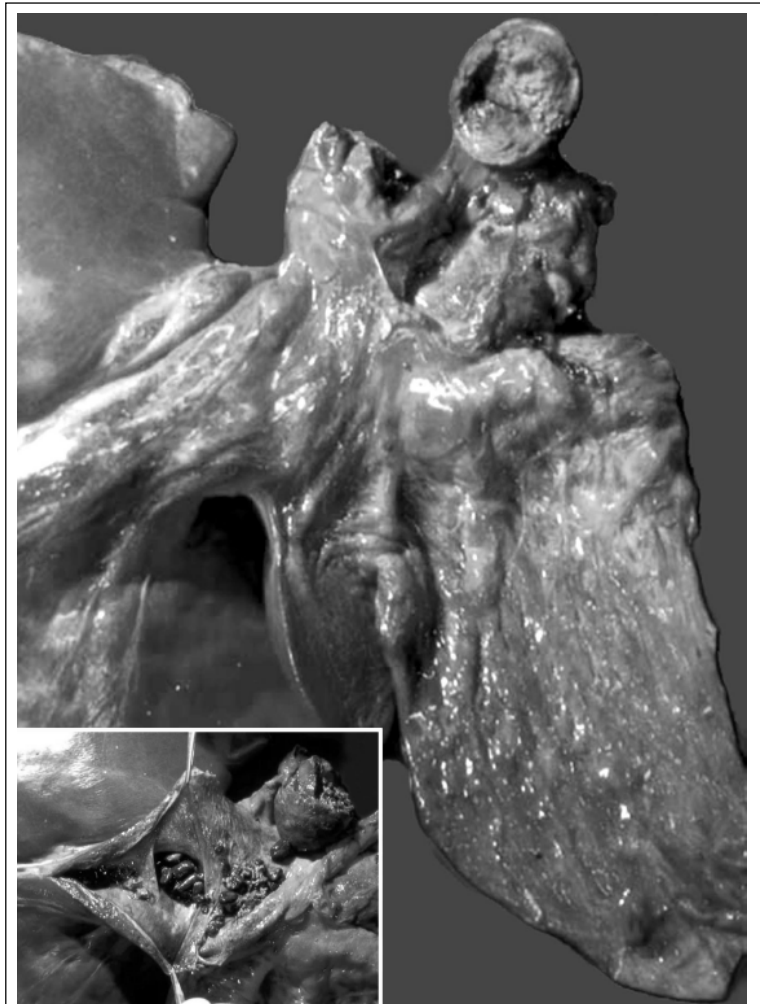
Figure 1 - Cholelithiasis in a horse. Severe atrophy of the right lateral hepatic lobe with a fragmented large choledocholith (9.5 x 4.5 cm) removed from the common hepatic duct. Inset: opened common hepatic duct with a fragmented large choledocholith (9.5 x 4.5 cm) and several smaller biliary calculi.

lobe was extremely decreased in size measuring approximately 23 by 11cm, and no more than 1cm thick (Figure 1). In sharp contrast, the left lateral and medial lobes were markedly increased in size. The liver had a diffuse brownish discoloration, was firm, and an evident lobular pattern was observed on the cutting surface. A large choledocholith measuring 9.5 x 4.5cm, with smooth surface was found in the common hepatic duct, which was apparently completely obstructed. Numerous choleliths and hepatoliths, moderately firm, ranging from 1.5 to 0.1cm in diameter, were located in virtually all intra- and extra-hepatic biliary ducts (Figure 1), which were markedly dilated (Figure 2). The largest choledocholith that was obstructing the common hepatic duct had a dry weight of 141.72g, whereas all the other biliary calculi extracted from the liver and