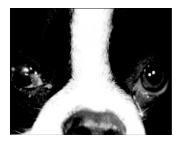
Figure 1A - Photographic image of a male, 10 months old, Boston Terrier. Note the loss of brightness of the cornea and accumulation of mucous discharge, characteristics of dry eye.

At the exam, the dog presented good clinical condition. Ophthalmologic exam revealed the right eye with mucous discharge over the eyelid and ocular surface. Moreover, hyperemic conjunctiva, blepharospasm and photophobia were also observed. Schirmer's tear test 1 (STT1) was performed and revealed values of 0 mm/min. and 28 mm/min. for the