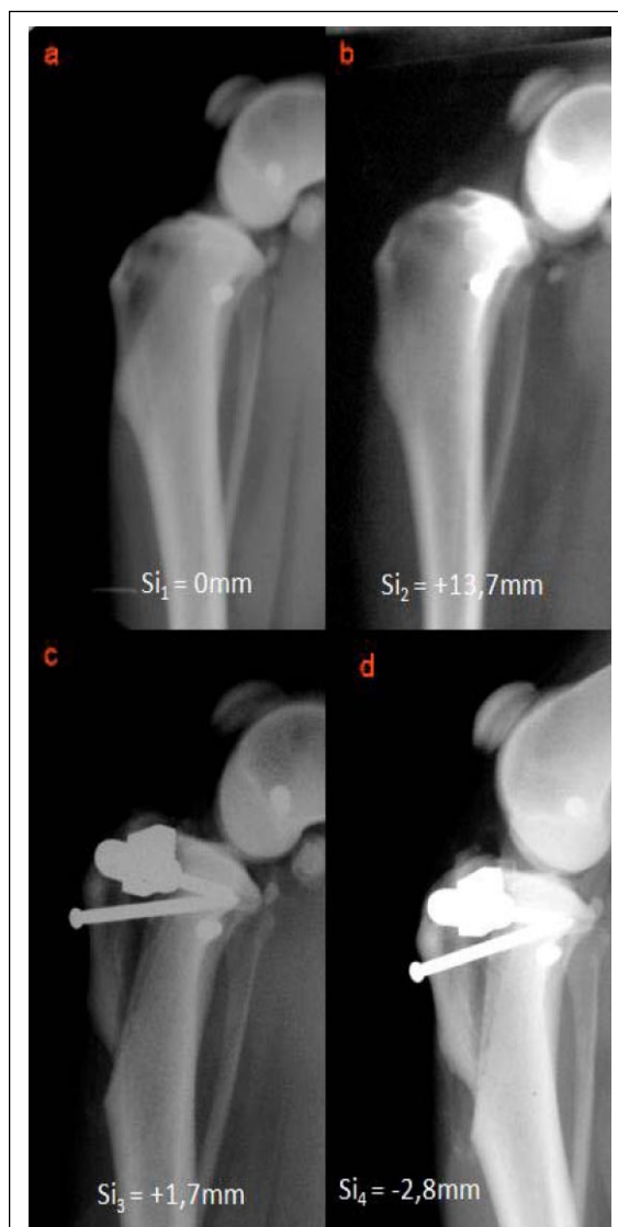
Figure 2 - Stress radiograph from one of the specimens used in this study. The reported values represent the means and standard deviations of tibial Subluxation (Si) with intact joint (A) and after successively CrCL transection (B), modified TTA stabilization (C), and CdCL transection (D).

The adequate radiographic positioning is confirmed by the similar patellar tendon angles among the seven limbs of around 100^{\circ} before and after the CCL desmotomy. In the other three specimens, a small difference was verified, with underestimation between angles at moments 1 (CCL intact) and 2 (After CCL desmotomy). In limbs 1 and 5 the angles were, respectively, 105^{\circ} and 100^{\circ} at moment 1 versus 100^{\circ}