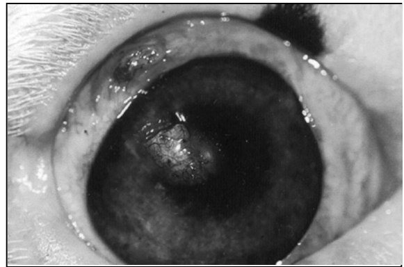
Figure 3 - Photography illustrating right cornea of a boxer breed dog with conjunctival graft four months after surgery. Note remodeling of the cornea and corneal vascularization.

(MAHMOOD & AWAD, 1998), but most of the cases referred in dogs present a history of ocular lesions. According to this, the case referred here had a history of corneal ulceration at the same site of the cyst and had been treated by the same group of doctors.