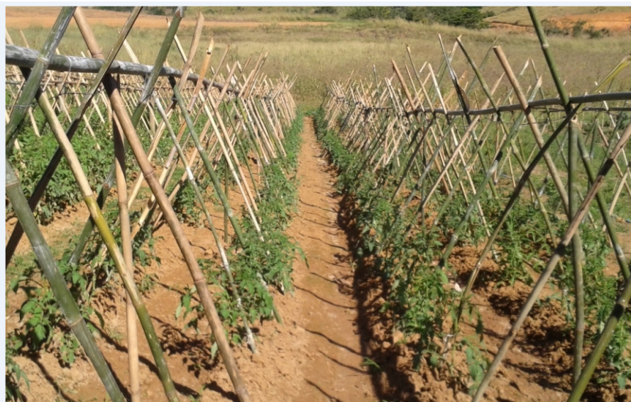
Figure 1 - Experiment to obtain the morpho-agronomic data, in the Agroecology sector of Ifes Campus de Alegre.

the genotype groups, using the CLUSTER and IML procedure of the SAS program (SAS Institute, 2000). For the application of the Ward grouping method, the distance matrix was obtained by the Gower algorithm (GOWER, 1971). The definition of the ideal number of groups was performed according to the pseudo-F and pseudo-t 2 criteria combined with the likelihood profile associated with the likelihood ratio test (SAS Institute, 2000).