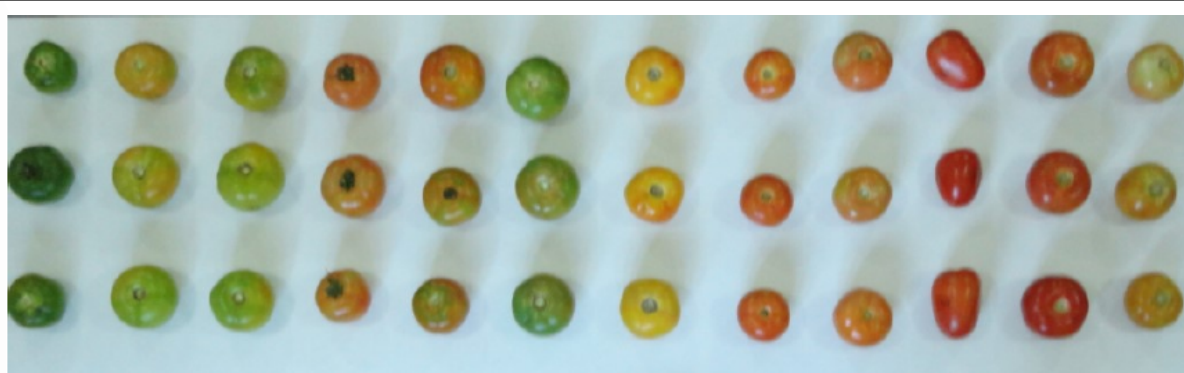
Figure 2 - Diversity of colors and formats found among the 37 accessions of S. lycopersicum L.

For the CFrm characteristic, there was a color variation in fruit ripening, resulting in the formation of five groups. Group 1, with 51.31% of the