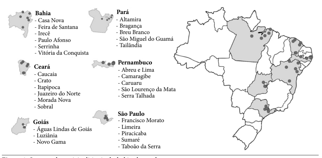
Figure 1. States and municipalities included in the study.

As soon as the baseline study was completed in a municipality, an anonymized listing of eligible children was sent electronically to the UFPEL where randomization was carried out immediately. Each child was identified by their date of birth and their Social Identification Number, a unique number allocated by the Ministry to all beneficiaries of social welfare. At UFPEL, all eli-