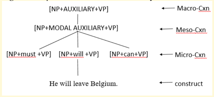
Figure 3: A partial constructional taxonomy

the TL hampers the reciprocal transformations in the translation process. Therefore, a conceptual mental space is needed to act as an interface between the SL and the TL.