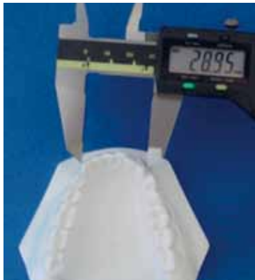
FIGURE 4 - IC distance at the respective FA points.

The formula proposed by Dahlberg 9 ( Se^2 = \sum d^2/2n ) was applied to estimate the order of variables of the casual errors, while the