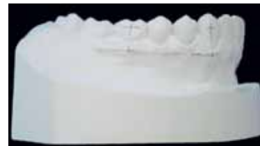
FIGURE 3 - Delimitation of Points WR with a graphite tip.