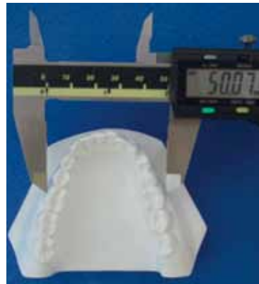
FIGURE 5 - IM distance at the respective FA points.