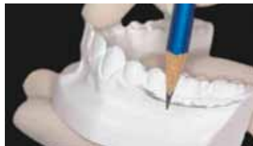
FIGURE 2 - Demarcation of the WALA ridge made with a graphite surface.