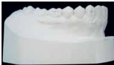
FIGURE 1 - Delimitation of Points FA with a graphite tip.