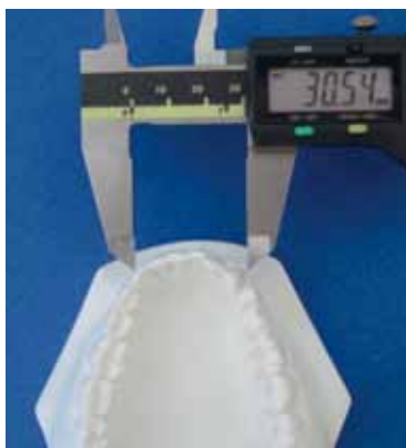
FIGURE 6 - IC WR distance at the respective WR points.