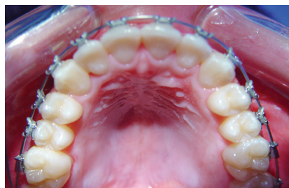
Figure 5 - Intraoral photograph at the end of the use of vertical elastics.