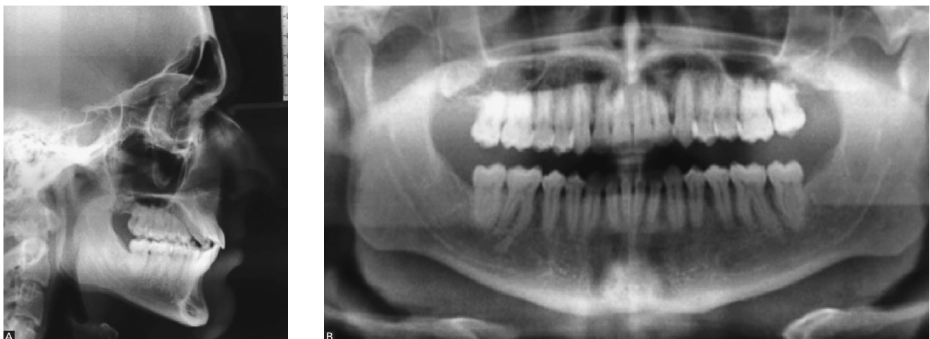
Figure 10 - Radiographs after 5 years in retention. A) Cephalometric radiograph; B) Panoramic radiograph.