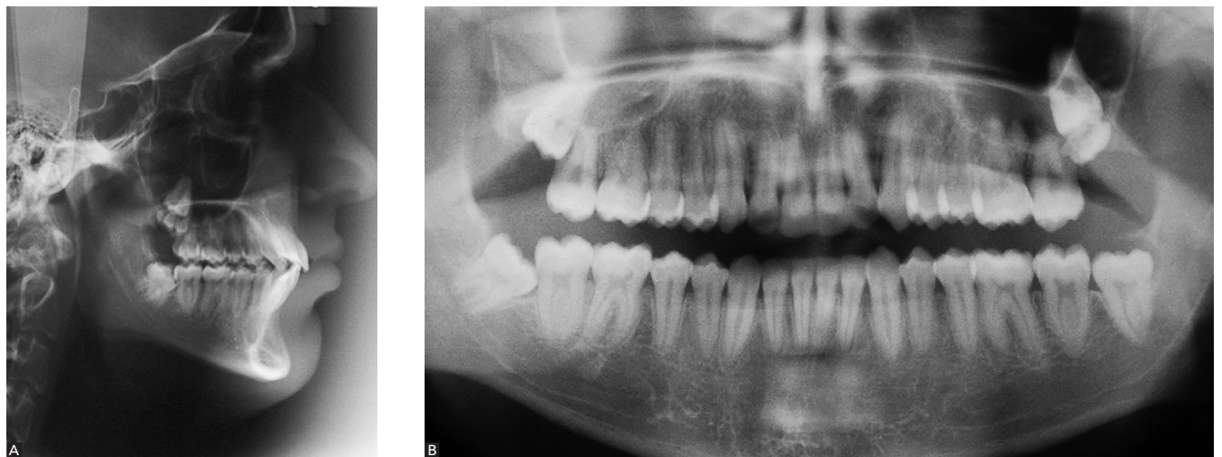
Figure 8 - Post-treatment radiographs. A) Cephalometric radiograph; B) Panoramic radiograph.