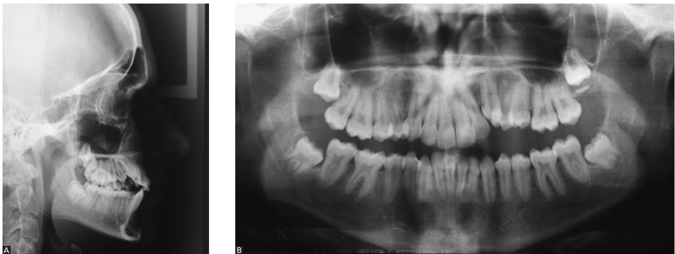
Figure 3 - Pretreatment radiographs. A) Cephalometric radiograph; B) panoramic radiograph.