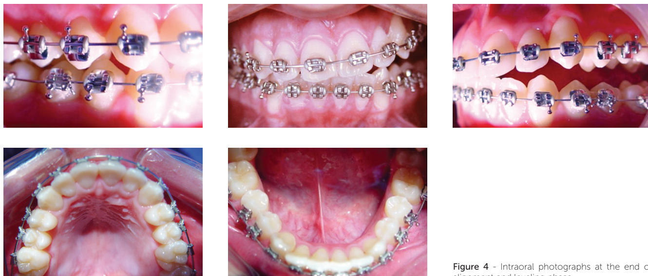
Figure 4 - Intraoral photographs at the end of alignment and leveling phase.

were removed and the same retention protocol was implemented (Figs 6, 7 and 8). The patient was referred to myofunctional therapy and extraction of third molars. He was reevaluated after five years in retention and a slight relapse of unilateral open bite was observed (Fig 9). Inclination of maxillary and mandibular incisors was different between post-treatment and retention phases (Fig 10 and Tab 1).