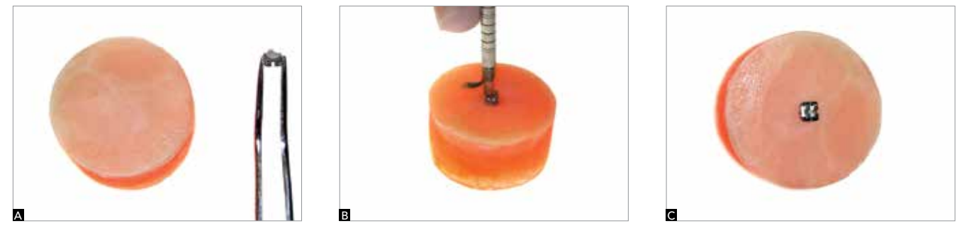
Figure 1 - Sequence of bonding, A) bonding material applied to the base of the bracket, B) pressure of 400 gF applied at the moment of bonding to standardize the material thickness, C) specimen.

Bond failure was observed by a single operator through a stereomicroscope with magnification of 40X. The Adhesive Remnant Index (ARI) was analyzed as suggested by Årtun and Bergland,<sup>1</sup> where 0 indicates no adhesive remnant in the dental structure; 1, less than half of remnant in the dental structure; 2, more than a half of remnant in the dental structure and 3, all the adhesive remnant adhered to the bracket base.